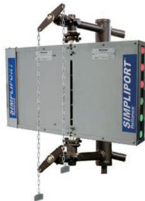
Direct-to-Drum Assembly with Simpliport® 180 Water Gage System