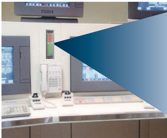
SIM Indicator in Control Room