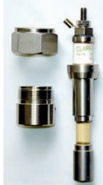
FSB Type Probe for Pressures up to 3000 PSI (200 Bar)