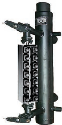
Steel Water Column with Probes and Flat Glass Gage