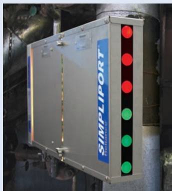
Simpliport 180° Water Gage System with LED illuminator

“I’ve never seen a gage that you can see so well from extreme angles. With this sight glass, I’m standing anywhere within 180° of it, the level is visible.”