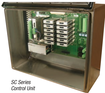
SC Series Control Unit