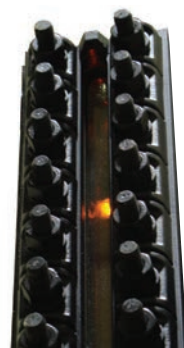
Flat Glass Water Gage with DuraStar Illuminator