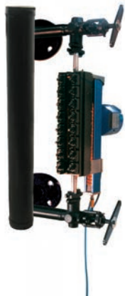
Direct-to-Drum Assembly with Flat Glass Gage and DuraStar Illuminator