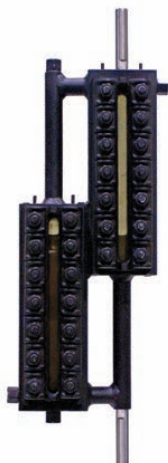
Flat Glass Water Gage